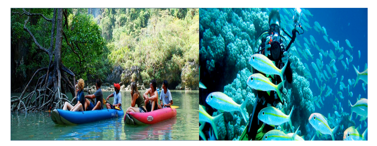
Day 13 Krabi-Bangkok

and let Thailand unfold before you as you see fit. Should you wish you can easily explore the islands of Phuket and Koh Phi Phi from your perfectly-stationed destination.